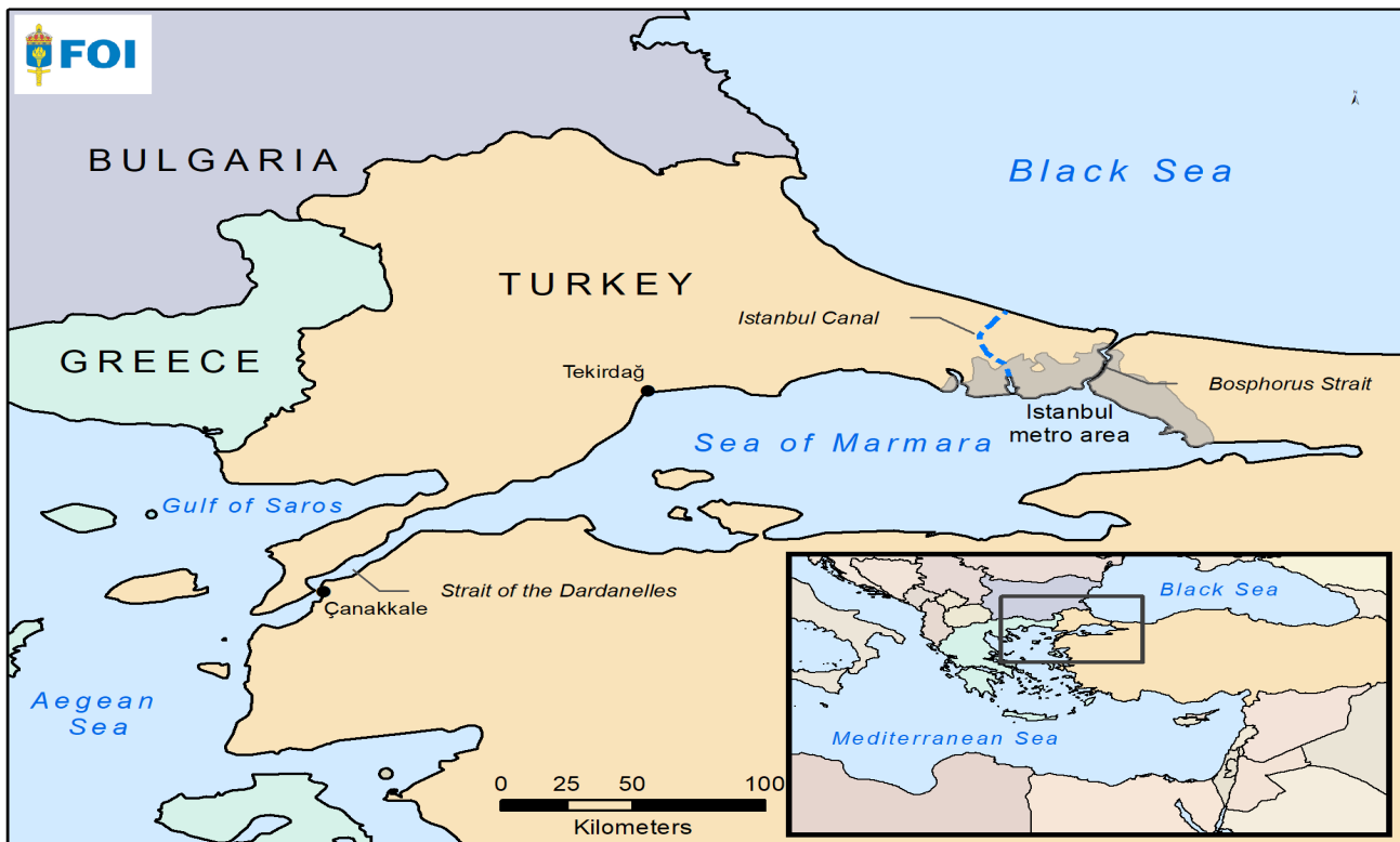
Map: Per Wikström, FOI

ON APRIL 5, 2021, Turkish authorities detained ten retired admirals who had warned against a withdrawal from the 1936 Montreux Convention. For 85 years, the convention has regulated trade and naval transit between the Mediterranean and the Black Sea via the Turkish Straits, one of the world's most strategically critical waterways.